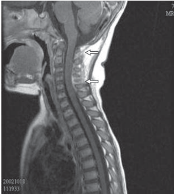
Fig. 1. Sagittal T1-weighted magnetic resonance imaging after intravenous gadolinium-diethylenetriamine pentaacetic acid administration shows abnormal enhancement in the interspinous space at the C2 to C5 level (arrows).

at admission and the blood culture obtained at another hospital yielded S. aureus which was susceptible to oxacillin. CSF and urine cultures were negative. Antibiotics were changed to oxacillin and gentamicin. Computed tomography of the brain was arranged due to persistent drowsiness but showed no abnormalities. Her condition improved gradually, except for persistent fever on the 10th day. In addition, irritable crying on movement of the neck with progressive limitation of neck motion developed, while only mild erythema over the posterior neck was noted. Radionuclide scan and echocardiography were arranged to identify the focus of the persistent fever. Echocardiography showed no evidence of vegetation or coronary vascular dilatation. Gallium-67 citrate whole body scan revealed active soft tissue inflammation in bilateral lower neck regions.