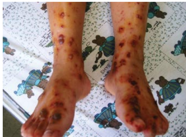
Fig. 1. Hemorrhagic bullae on bilateral feet

fever. Skin rashes and arthralgia developed 2 days later. The rashes presented as palpable purpuric lesions initially, which were distributed on the buttocks and lower extremities. Bullae developed within 3 days. The patient was then admitted to our hospital. On examination, the patient had diffuse purpura over her buttocks and lower extremities. Multiple hemorrhagic bullae in various sizes were located on the base of the pupura (Fig. 1). They ranged in size from 2 to 10 mm in diameter.