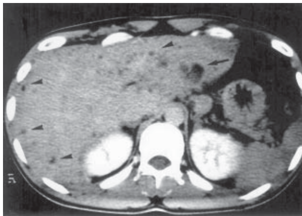
Fig. 2. Computed tomography scan of abdomen shows a heterogeneous hypodense lesion about 2.5 cm over the left lobe of the liver, segment 3 (arrow), and diffuse tiny homogeneous hypodense lesions over both lobes of the liver (arrowheads).